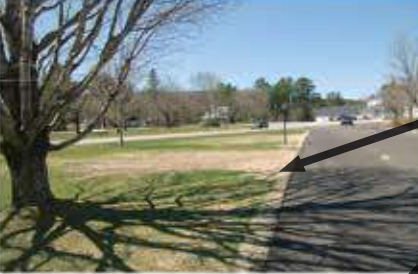
Church parking snow is pushed into the common; snow storage damage

North Shore Road, main road through town. Store / Post Office and Old Fire Station Parking