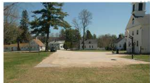
TOWN HALL PARKING

Library and Assesors office parking Church Parking